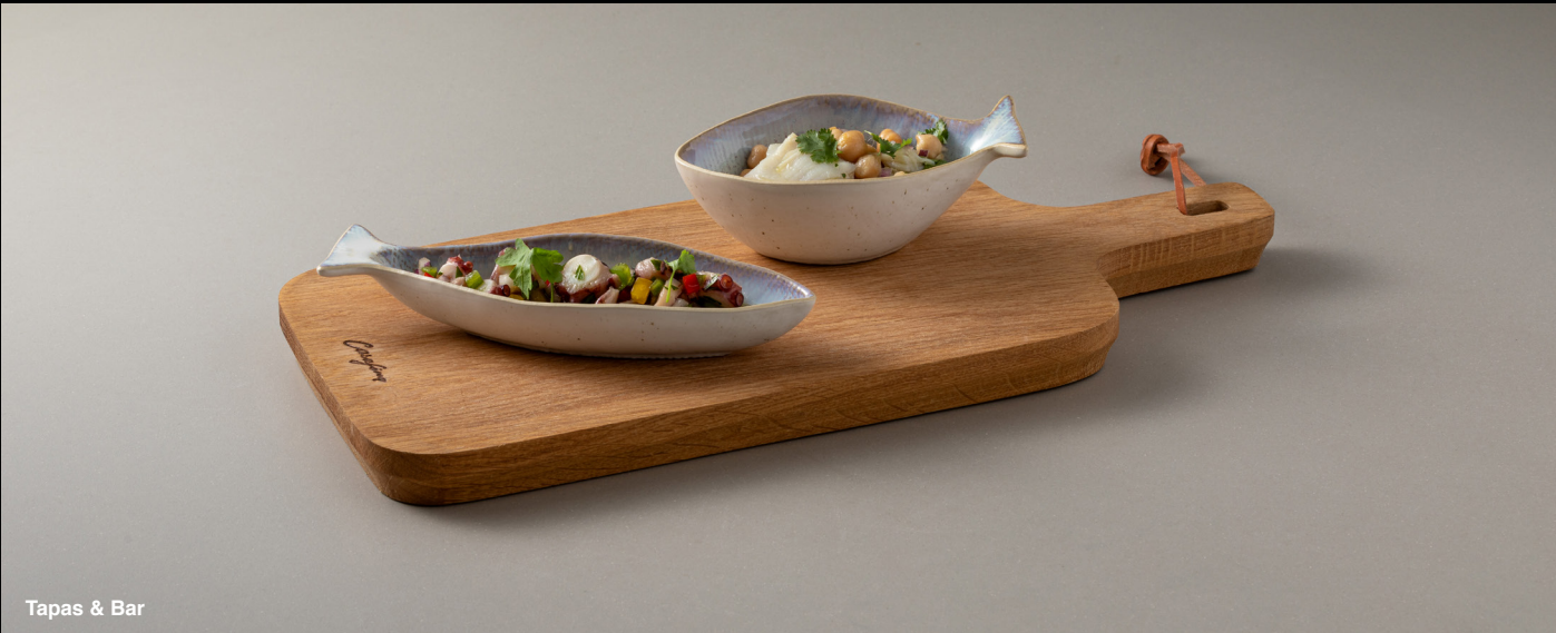
Tapas & Bar