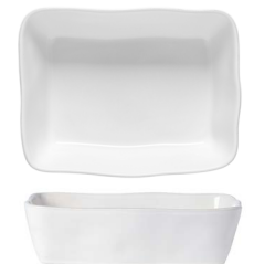
Rect. baker 26 LSR251-WHE 25.7 x 18.6 H6.8 cm | 167.5 cl [1]