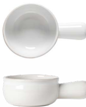
Onion soup bowl w/ handle 20 DS192-WHI 19.6 x 12.7 H5.9 cm | 46 cl [4]