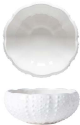
Urchin bowl 18 MRS181-WHI D18.4 H7.2 cm | 95 cl [6]