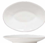
Oval platter 20 LSA201-WHI 19.7 x 14 H3.2 cm [2]