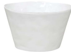
Party bucket 32 LSD321-WHI 32.3 x 24.4 H21.1 cm [1]