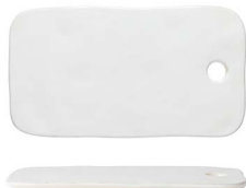
Rect. board 32 LSA201-WHI 32.2 x 17.9 H1.2 cm [1]