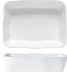
Rect. baker 30 LSR301-WHE 30 x 22.3 H7.4 cm | 257 cl [1]