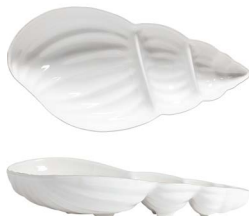
Appetizer dish 41 MRD402-WHI 40.6 x 20.6 H8.4 cm [1]

Complete the 3-section rect. wood tray 25 with: Dip dish 7 | Low dip dish 7