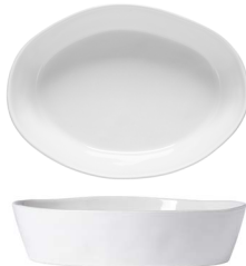
Oval baker 30 LSA301-WHE 30.4 x 22.3 H7.5 cm | 240 cl [1]