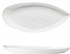
Tray 46 MRA451-WHI 45.5 x 20.7 H4.4 cm [1]