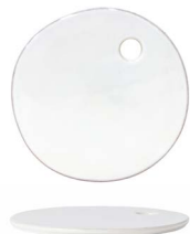
Round board 21 LSD212-WHI D21.2 H1 cm [1]