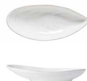
Tray 19 MRA191-WHI 18.9 x 8.2 H3.4 cm [4]