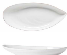
Tray 31 MRA311-WHI 31.1 x 14.2 H4.3 cm [1]