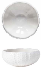
Urchin bowl 14 MRS143-WHI D14.4 H6 cm | 43.5 cl [6]