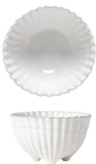
Shell footed bowl 14 MRS142-WHI D14.2 H8.2 cm | 53 cl [6]