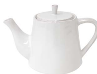
Tea pot 108 cl LSX241-WHE 24 x 14 H14.8 cm | 107.5 cl [1]