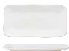
Rect. tray 30 LSP301-WHI 29.5 x 15.2 H2.2 cm [1]