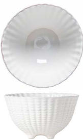
Shell footed bowl 20 MRS201-WHI D19.8 H11.7 cm | 154.3 cl [6]