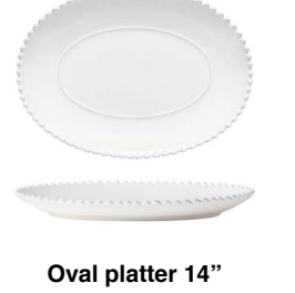
O PEA331-WHI PEA331-CRM PEA331-LLY 13 1/2" x 9 7/8" H1 3/8" [1]