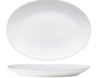
Oval platter 20" O PEA501-WHI