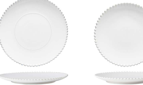
Round plate 14" O PEP331-WHI