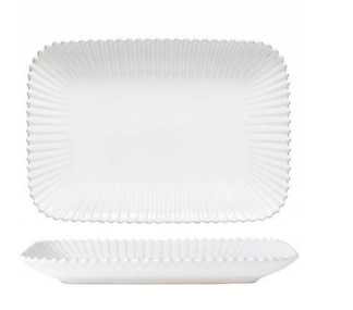
Rect. platter 16" O PER403-WHI