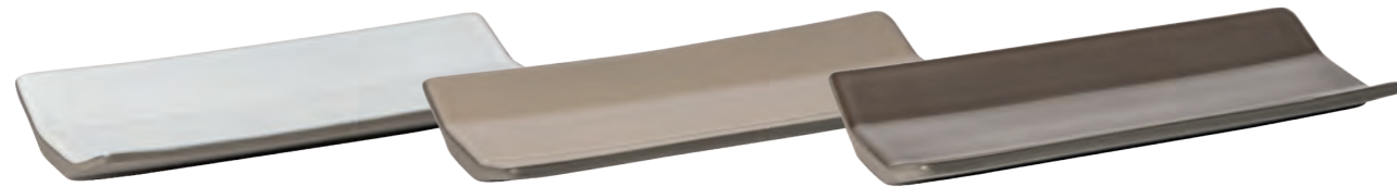
SHORELINE GREY (GRY)